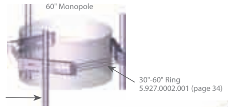
5.927.0007.004 2 3/8" x 4' Pipe Mount Kit

These Pipe Mount Assemblies can attach directly to Ring Assemblies or Standoffs (ordered separately) using two accompanying 1/2" u-bolt assemblies. If straddling two Ring Assemblies, e.g. dishes 8' and larger, choose from our kits that come with four 1/2" u-bolt assemblies.